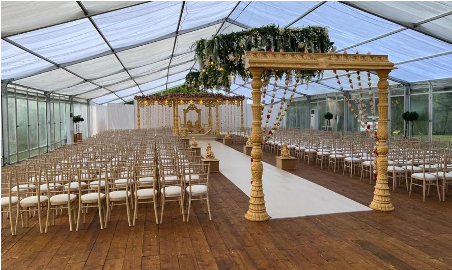
@ Hazlewood Castle