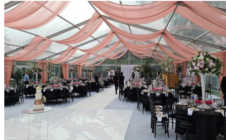
@ Hazlewood Castle