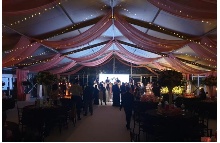
@ Hazlewood Castle