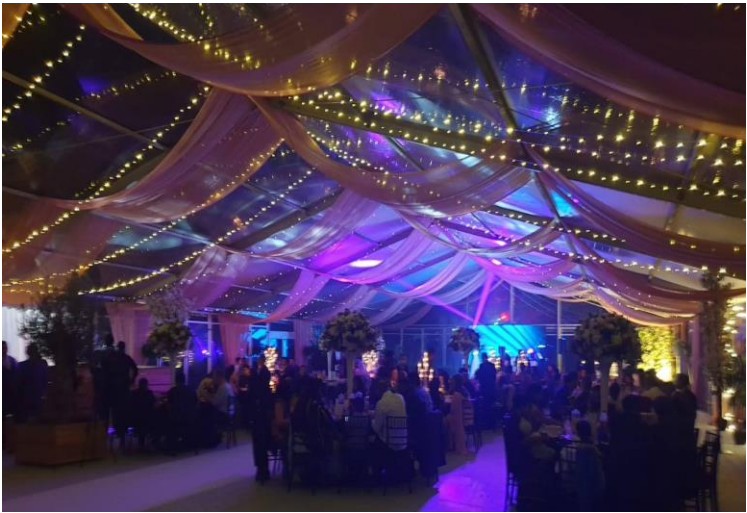
@ Hazlewood Castle